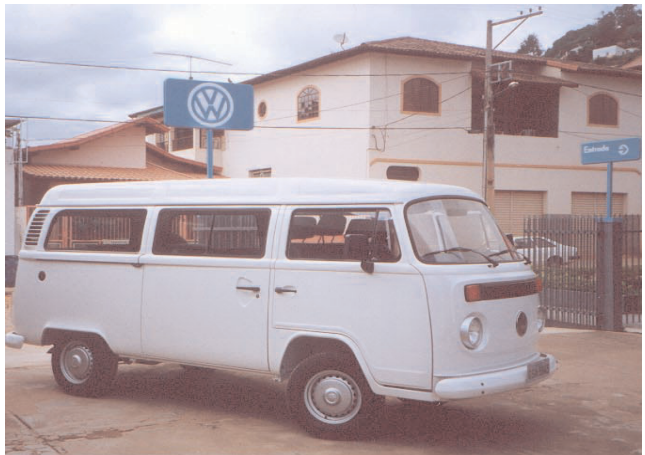
God recently provided Byron this van to be able to bus the visiting groups to the various ministry locations.

In the city of Belo Horizonte the population is 3.5 million. In this vast city, there are only two hospitals equipped to handle HIV patients. I have been asked to initiate and develop a Chaplaincy program in one of these hospitals.