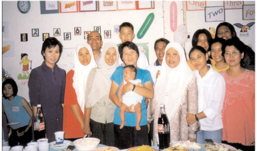
A Christmas gathering.