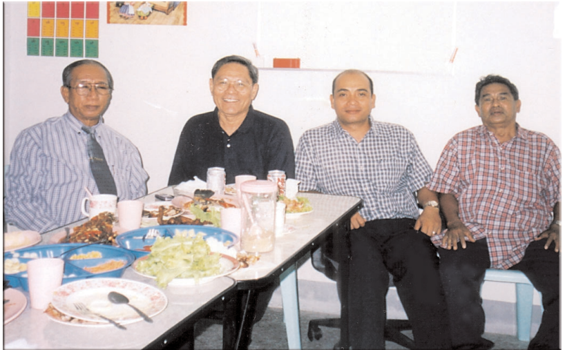
Lunch at the clubhouse with some local friends who are helping us.