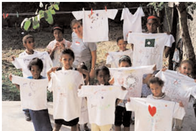
The children made their own vacation bible school t-shirts