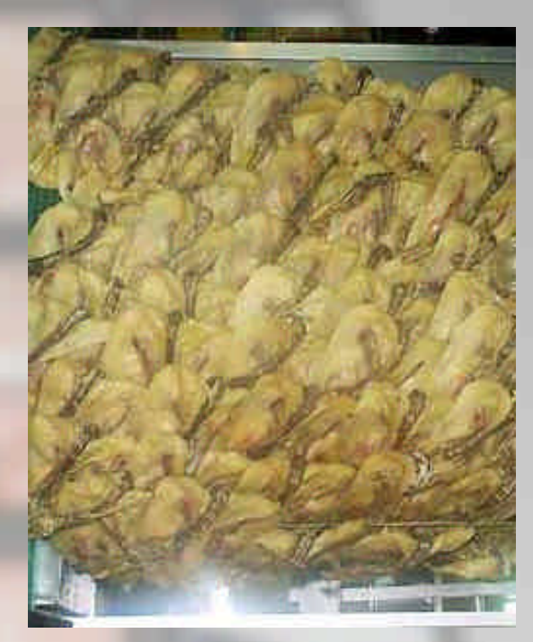
China is of course famous for Peking duck. Sometimes the food is pretty good, we just don't like seeing it in the market!