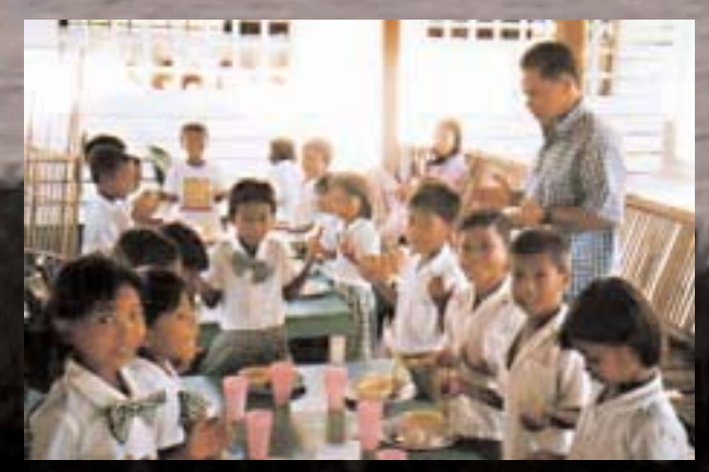
Children praying for the meal in our food program in the Muslim village