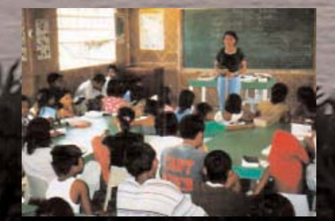
Teens discipleship class in Punta Biao.

CRC is now in the process of organizing Father's and Mother's Clubs in this same community. More than 60 mothers and 30 fathers have already signed up. These clubs are organized for the purpose of enhancing the personal, family and community lives of these Muslim people. The programs will be geared toward the development of the physical, moral, intellectual, economic, social and most important of all, spiritual aspects of their lives. The main activity of the clubs will be to study the Scriptures to deepen their understanding of the Christian faith and teach them how to live in accordance with what the bible teaches. Please help us pray that the Lord will also supply the needed bibles for this group as He did with the teens. We are also praying that out of these adults & teens we can train and develop leaders that will be an important part in taking the gospel to other Muslim villages in the area.