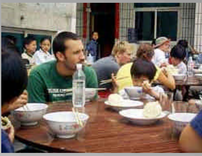
Sometimes it is not what you eat but where. One of our college teams lived in an orphanage with the children for two weeks. Meal time was a challenge for them It's amazing that even the vegetarians were dreaming of Big Macs!