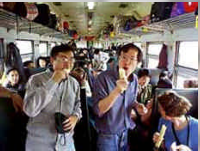
Eating can also be lots of fun. Here are some of our folks eating raw sugar cane on a train in China. It's actually pretty good except for the way it makes your teeth turn black!