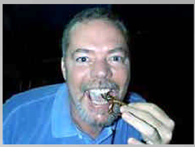
Yes, of course I ate locust. Turns out they use peanut oil and they are actually pretty good! To be honest, I couldn't get the fat worm to go down, so I had to make due with the bug.